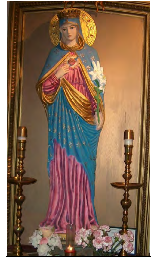
We are what you once were. We believe what you once believed. We worship as you once worshipped. If you were right then, we are right now. If we are wrong now, you were wrong then.

2404 Stuart Street-Tampa, FL 33682 Website: http://www. Immaculateheartofmarychapel.com P.O. BOX 280348 – Tampa, FL 33683 PH (813) 248-4460